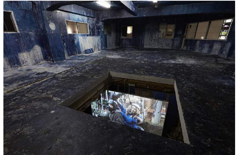
Drawing a Blueprint Version 2 (2016) and the 2.5 square meter hole