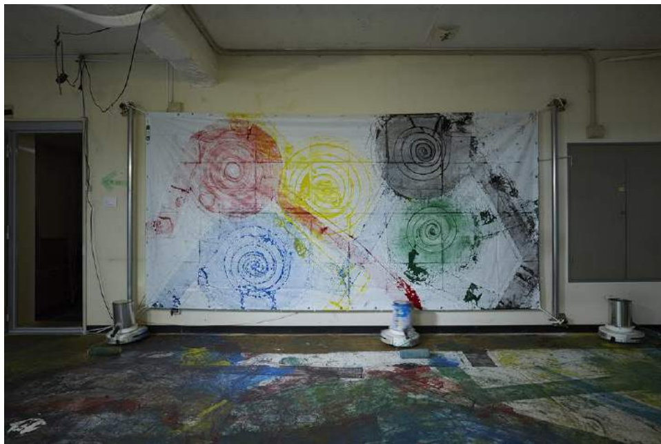
Five Rings (2016)