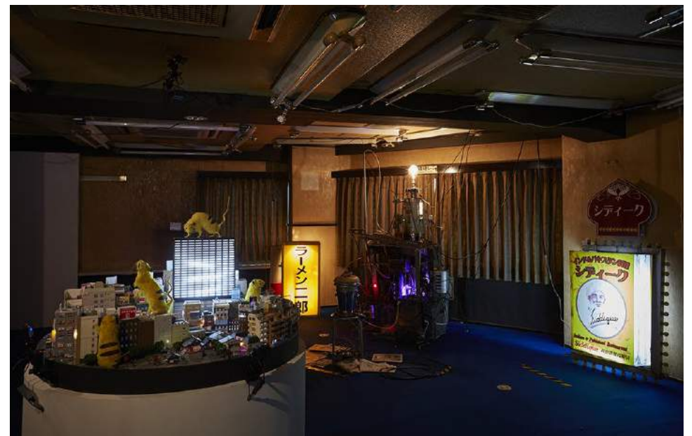
SUPER RAT -Diorama Shinjuku- (2016) and Libido-Electricity