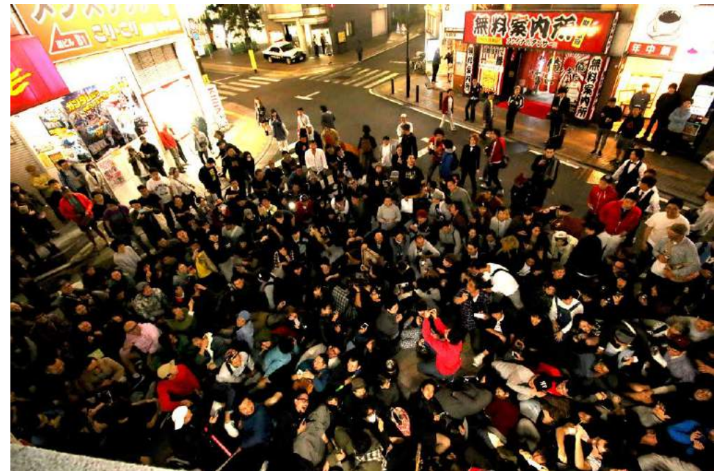
Experimental theater group Akuma no Shirushi's performance outside