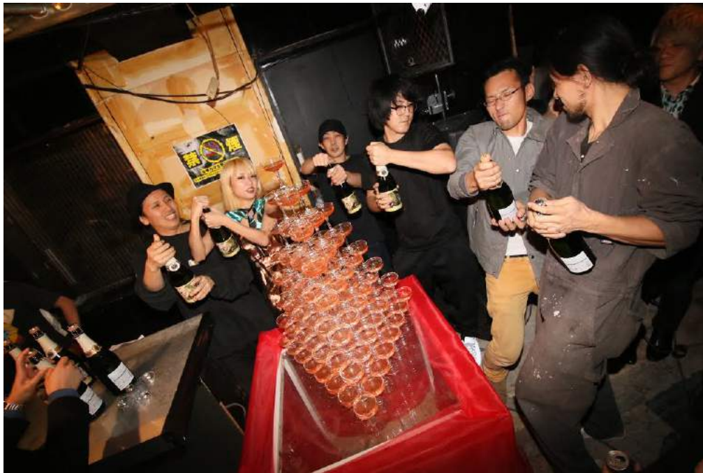
Chim ↑ Pom members giving a toast at the opening reception

Here are some sneak-preview photos from the exhibition and events: